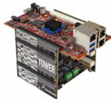
Figure 1. TWR-LS1021A module (TWR-LS1021A, TWR-SER-IO and TWR-ELEV)