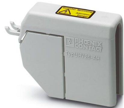
Illustration shows the product version UHV 25-AH

http://eshop.phoenixcontact.de/phoenix/treeViewClick.do?UID=2130444